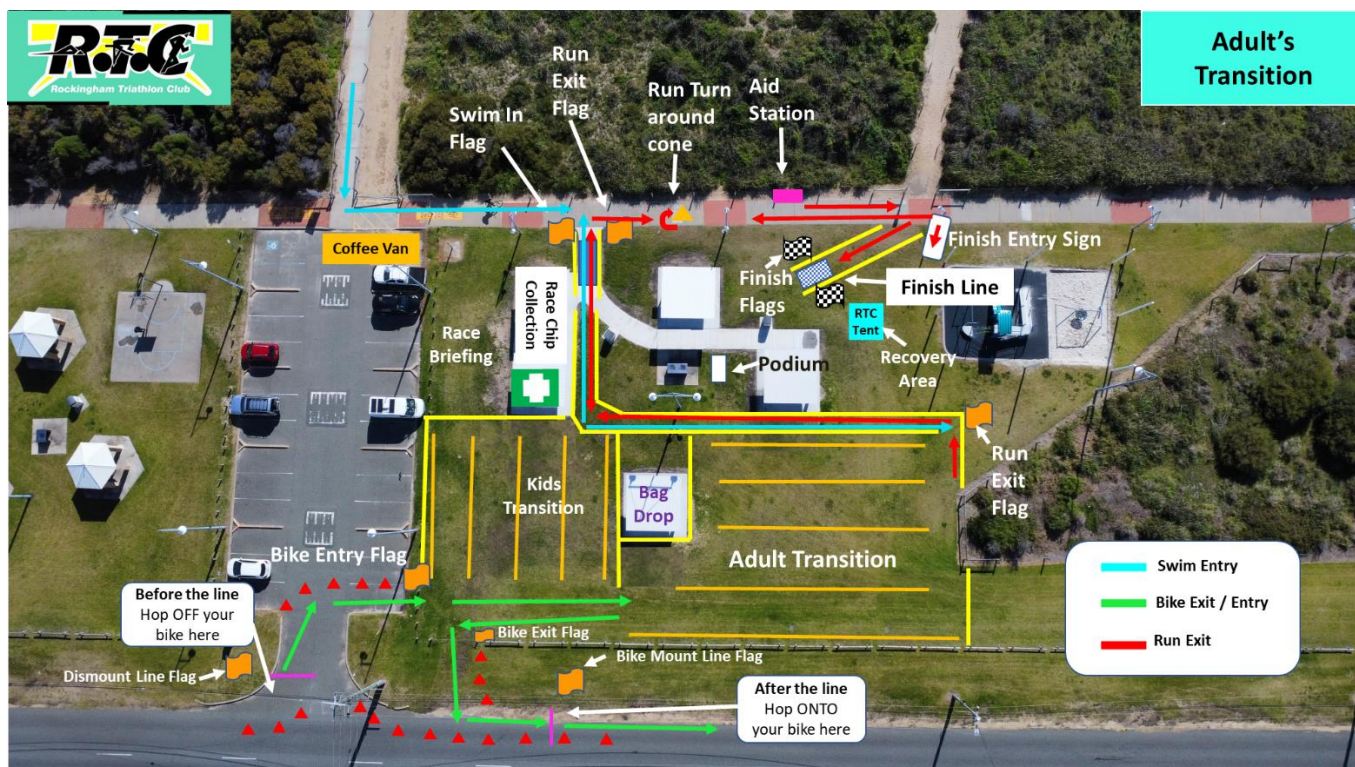
RTC Sprint Triathlon event area map including locations and transition area