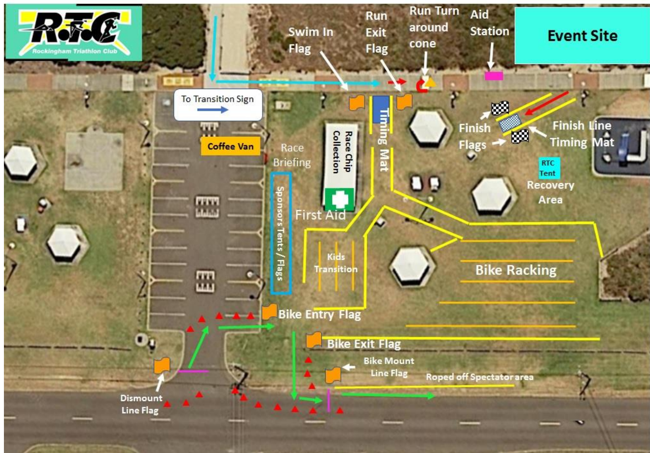
RTC SuperSprint Triathlon event area map including locations and transition area